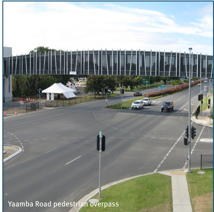
Yaamba Road pedestrian overpass

* Includes $278 000 Queensland Government contributions to National Network projects.